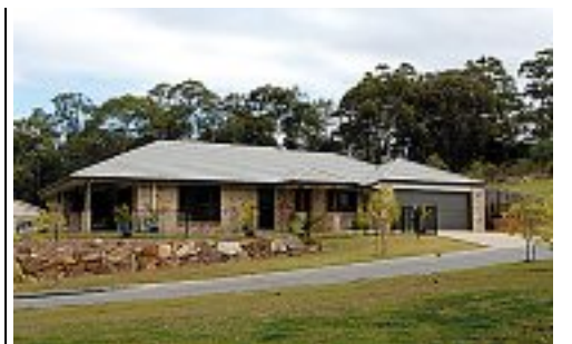
Little Mountain 11 Greensboro Place

Strict Instructions - Bring All Offers ... Don't miss this fantastic opportunity to purchase this immaculate 4 bedroom home tucked away in Little Mountain's most desirable neighbourhood, quiet cul-de-sac overlooking parkland, solar heating, a/c and media room.