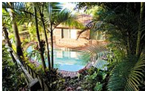
Buderim 18 Nirvana Crescent

Emporio will be released over three stages and will take three years to complete, with construction set to start in early 2009.