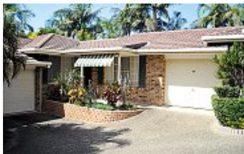
Maroochydore U11-228 Main Road