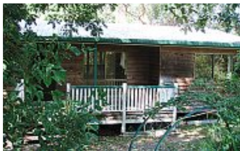
Cooran 14 Arthys Road

Will Be Sold, Don't Be Disappointed. Don't miss out. If you're looking to get your foot on the property ladder this is the ideal first home. Located at the end of a quiet street on 600m 2 block of land this timber highset 3 bedroom, 1 bathroom home is for you. Be there!