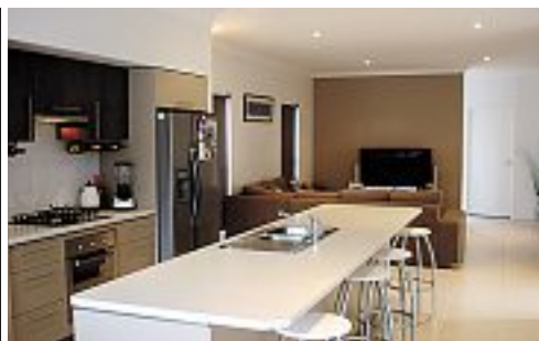
Kawana Forest Lot 189 Kurrajong Crescent