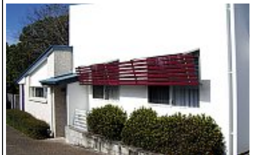
Nambour 1/16 Solandra Street