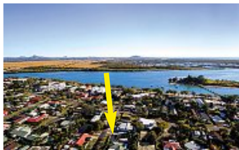
Maroochydore 19 Buna Street

Owner's words "Renovate or Detonate". I think it is definitely the former but come and make up your own mind on this 3 brm home with pool. Just metres from Maroochy River and minutes from the CBD & Sunshine Plaza. Highly sought after area at entry level price.